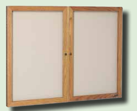
wood framed forbo bulletin board cabinet