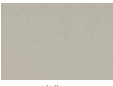
2206 oyster shell