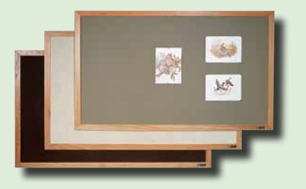
wood frame boards