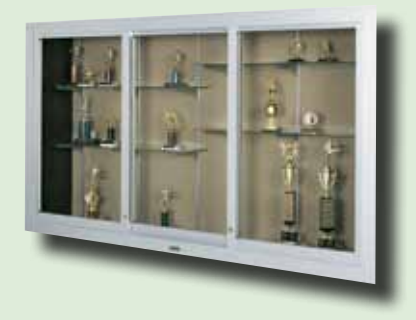
display case and forbo bulletin board back panel cabinet